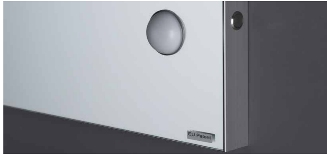
I-light brightness adjustable lenses. Stainless steel switch

Cantoni has combined the unique quality of the exclusive I-light system, specific for make-up, with large mirrors and easy to combine to fit any space. The range of MDE mirrors, with linear and essential lines, fits perfectly in any room. Italian artisan production.