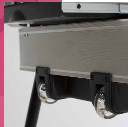
TRANSPARENT RUBBER WHEELS with ball bearings