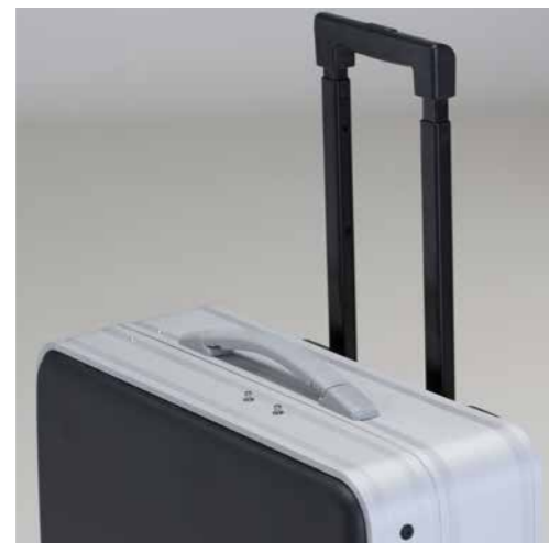
TELESCOPIC TROLLEY with spring lock button REINFORCED STRAP HANDLES