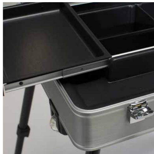
SLIDING TRAYS KEY LOCKS