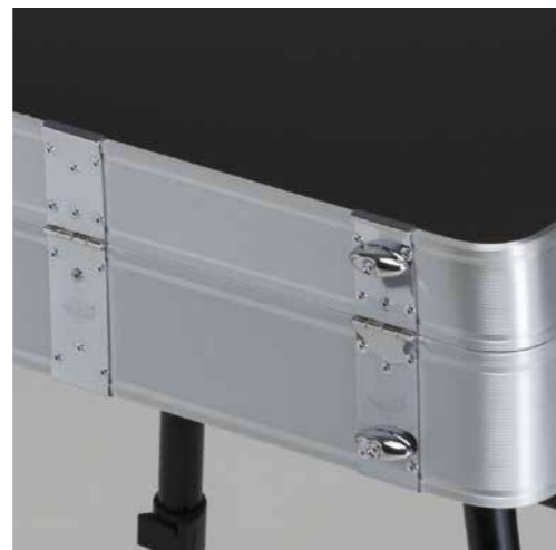
REINFORCED CHROME HINGES