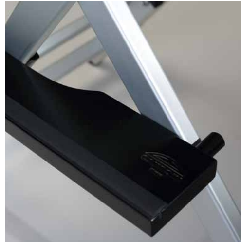
Black lacquered FOOTREST with anti-slip band and engraved Cantoni's logo