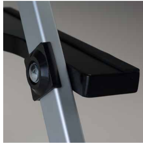
FOOTREST rear reinforcement