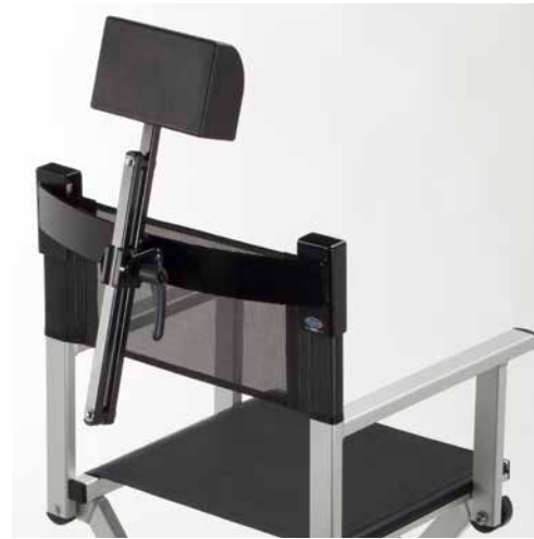
DETACHABLE HEADREST on request

Portable chair for professional make-up, produced in Italy. Characterized by very low weight which makes it easy to transport.