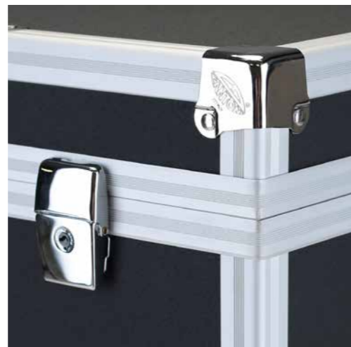
ANODISED ALUMINIUM PROFILES CHROME ACCESSORIES KEY LOCK