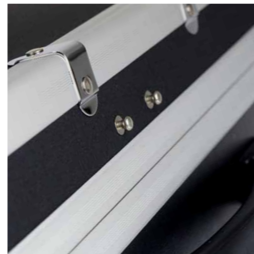
PRE SET-UP SYSTEM with standard locking system for the face-chart holding project