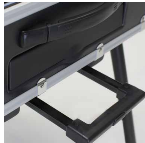
TELESCOPIC TROLLEY with spring lock button REINFORCED STRAP HANDLES