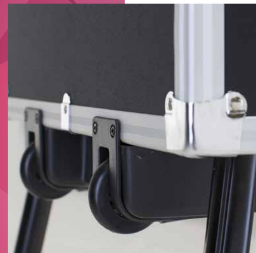
RUBBER WHEELS with ball bearings