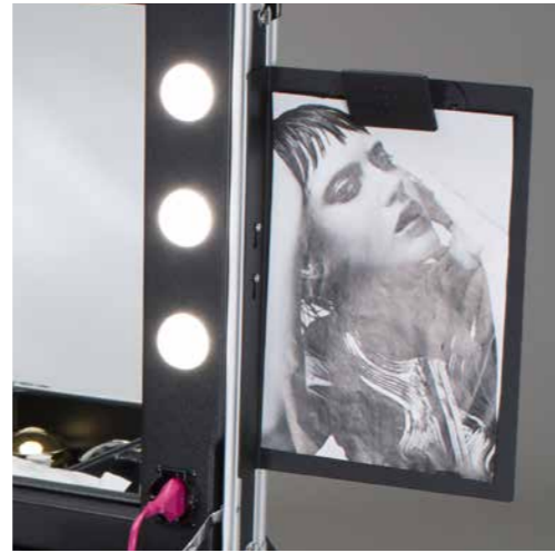
HOLDING FACE-CHART STAND Universal power socket 110-240V