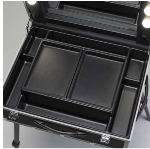
Large central compartment, sliding trays with aluminium guides, magnetic closure