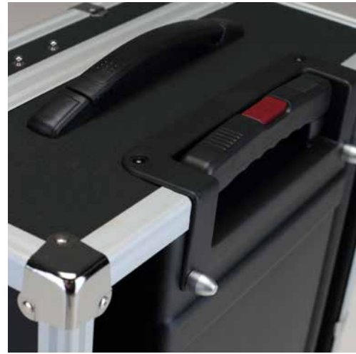
Trolley with square section telescopic handle. Retractable handle with locking button.