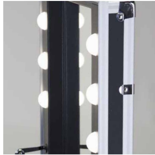
CANTONI I-LIGHT LIGHTING SYSTEM with dimmer button to adjust the brightness

The VT101C-TR station is the make-up case that combines ideal capacity, comfortable work spaces and transportability.